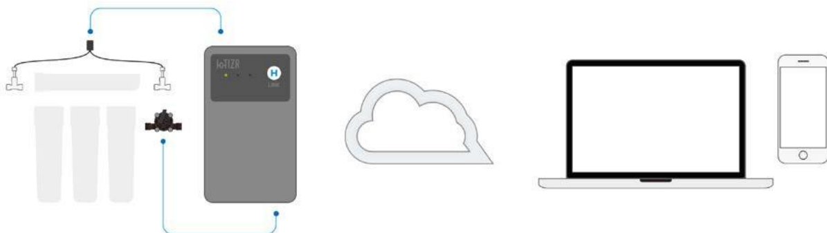
Figure 2: HARPS diagram for a remote water filter monitoring system with dedicated WLAN gateway, cloud and application server

The above-mentioned processes are unsatisfactory because the implementation costs are too high (GSM connection), because the simple app solution via Bluetooth can only be implemented at distances of up to a few metres (that is to say over a short range) and because the WLAN gateway access is insecure. The approach which is based on the shared use of (WLAN) gateways frequently presents operators of remote monitoring with a dilemma in practical operation. Data transmission via a shared WLAN gateway cannot be guaranteed; a dedicated WLAN gateway for the filter monitoring means high additional costs. Conclusion: a simple and reliable solution for reasonably priced remote filter monitoring is not yet available!