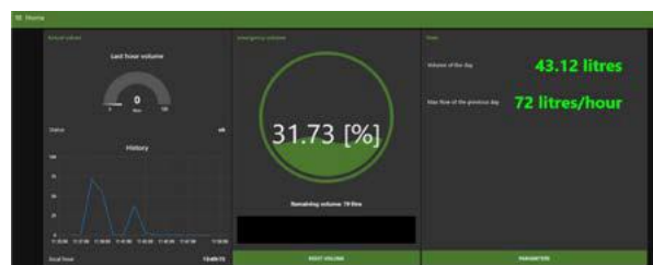
Figure 5: View of the APP: measurement data evaluation

Filter capacity alarm and measurement data depiction on the GUI, the graphical user interface, can be quickly realised. The coding/programming of the graphical user interface can be outsourced to an external developer.