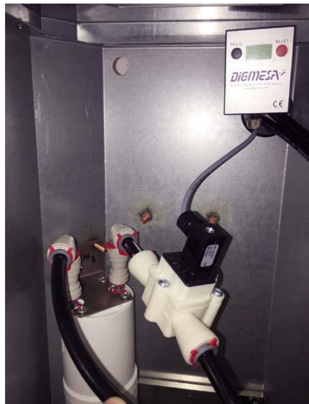
Figure 1: Filter cartridge (bottom left) with flow-rate sensor (white) with alarm module (Digimesa)

Ion exchange-based water softeners often employ filter cartridges whose resin binds the undesirable calcium ions. These cartridges have to be replaced after passing a certain volume of liquid. This flow volume is dependent on the hardness of the untreated water and the desired hardness of the filtered water. As a general rule, larger cartridge-based water softeners keep a running total of the flow volume and trigger an alarm on reaching the maximum capacity, signalling the need for a manual filter change. In this case, the alarm is visible on a display or LED; an audible alarm may also be employed. The problem here is that the alarm is not passed on, that is to say it is only visible or audible in the immediate vicinity of the filter . This means that the operator would have to be in close proximity to the water filter to become aware of the alarm, in effect to be standing next to the water filter, then change the cartridge and reset the flow sensor.